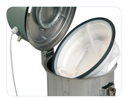
Easy to service